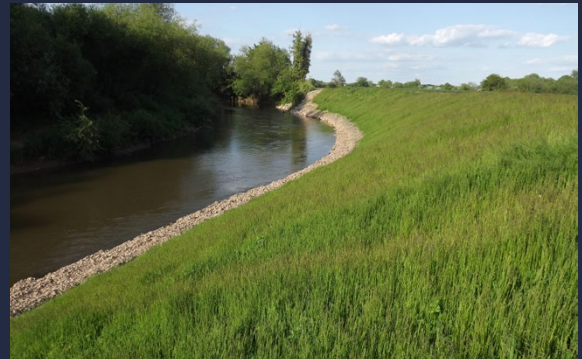
VMax Shear Stress Turf 3 months after installation

Applications include high flow channels, stream banks, shorelines and spillways where rock rip rap, articulated concrete blocks and poured concrete were once the only suitable alternatives for erosion protection.