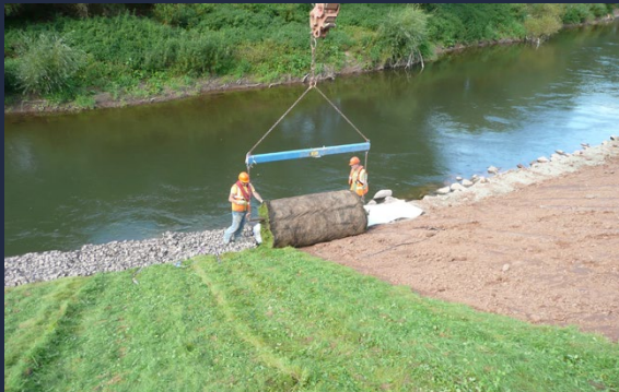
VMax Shear Stress Turf installed with lifting beam

Salix have the facilities to contract grow turf using the VMax range of TRM's. VMax C350 or C500 is used as the reinforcement element within the turf giving unprecedented protection performance.