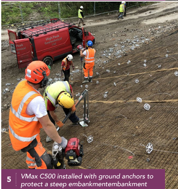
5 VMax C500 installed with ground anchors to protect a steep embankment