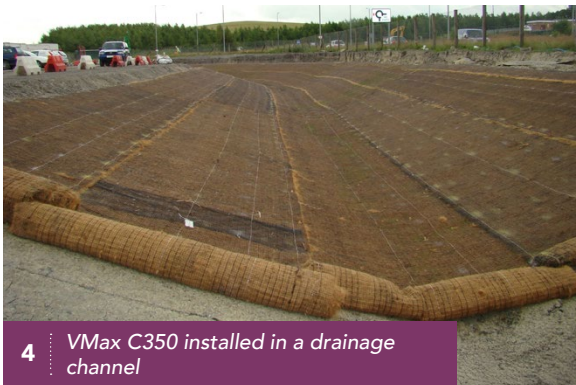
4 VMax C350 installed in a drainage channel