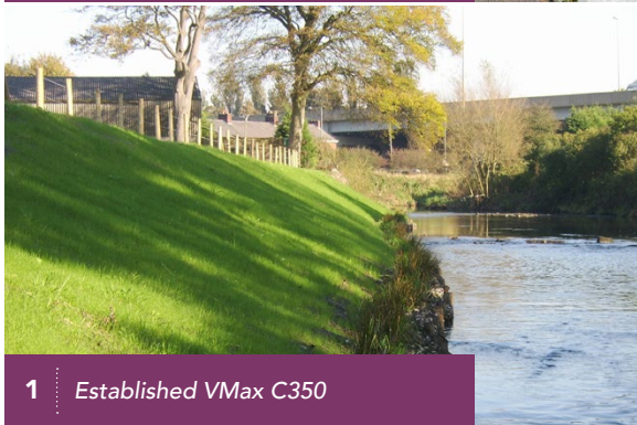
1 Established VMax C350