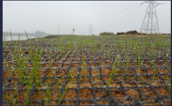
Early germination through VMax C500