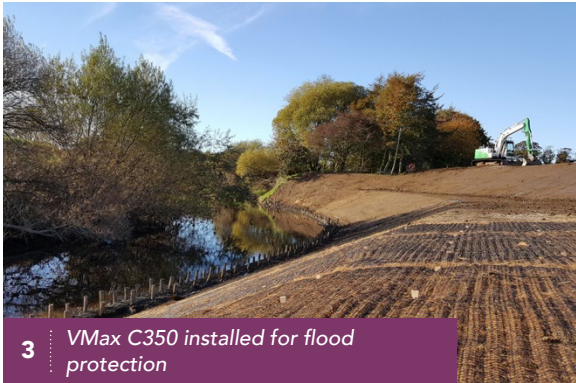
3 VMax C350 installed for flood protection