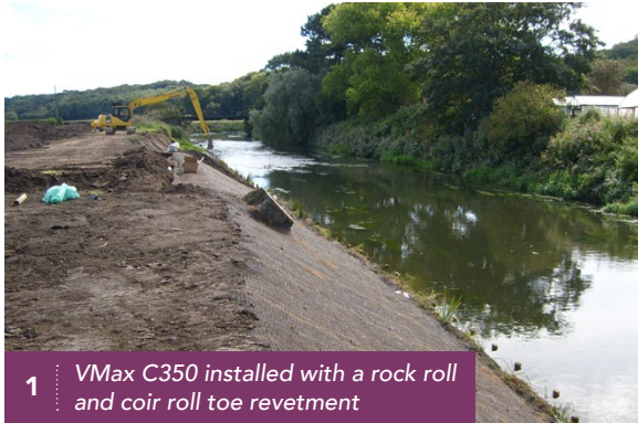
1 VMax C350 installed with a rock roll and coir roll toe revetment