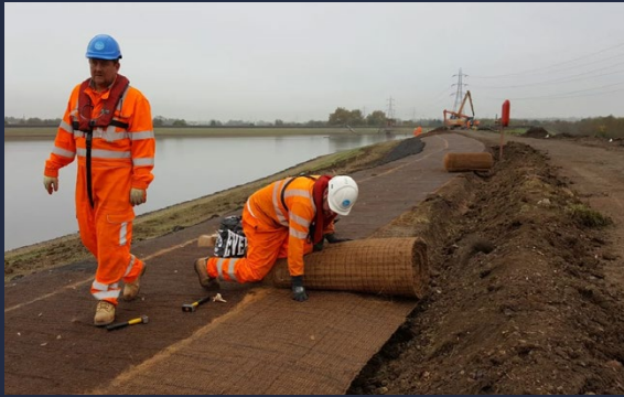
Installing VMax C500 over prepared seeded soil

A new hybrid product with added performance of VMax C350 with a coir fibre core layer. A high tensile strength 3D skeleton composite Geomat.