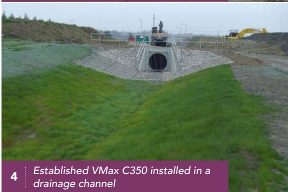
4 Established VMax C350 installed in a drainage channel