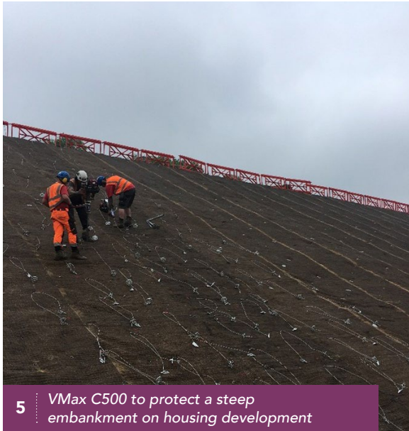
5 VMax C500 to protect a steep embankment on housing development