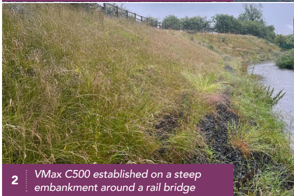
2 VMax C500 established on a steep embankment around a rail bridge

Natural coir fibers, which provide a unique combination of strength, durability, and environmental benefits