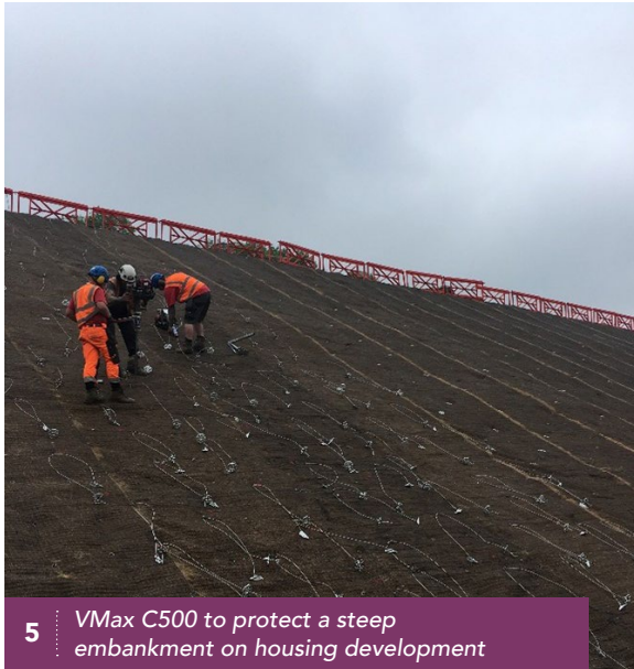
5 VMax C500 to protect a steep embankment on housing development