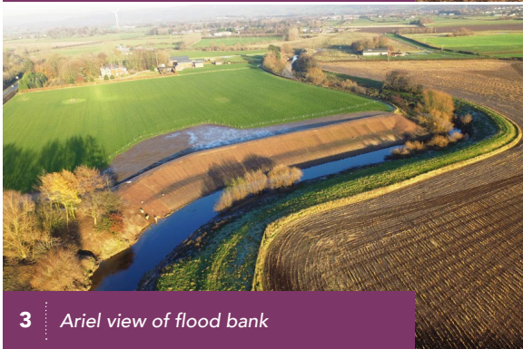
3 Ariel view of flood bank