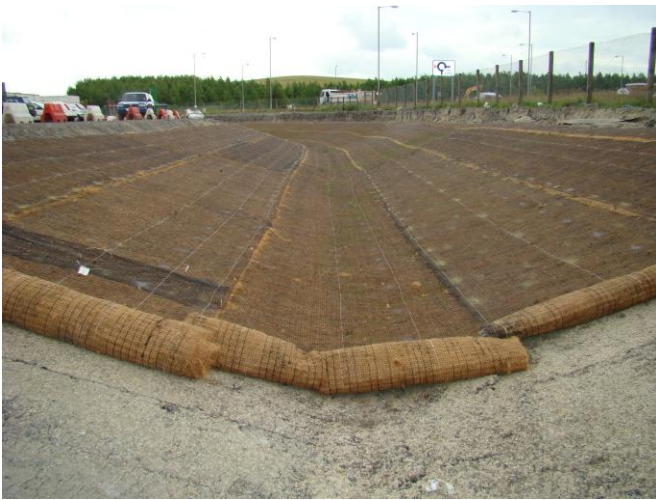
Vmax C350 laid over prepared seeded