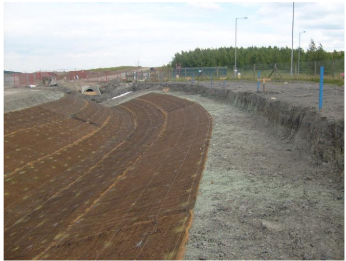
Newly installed Vmax C350