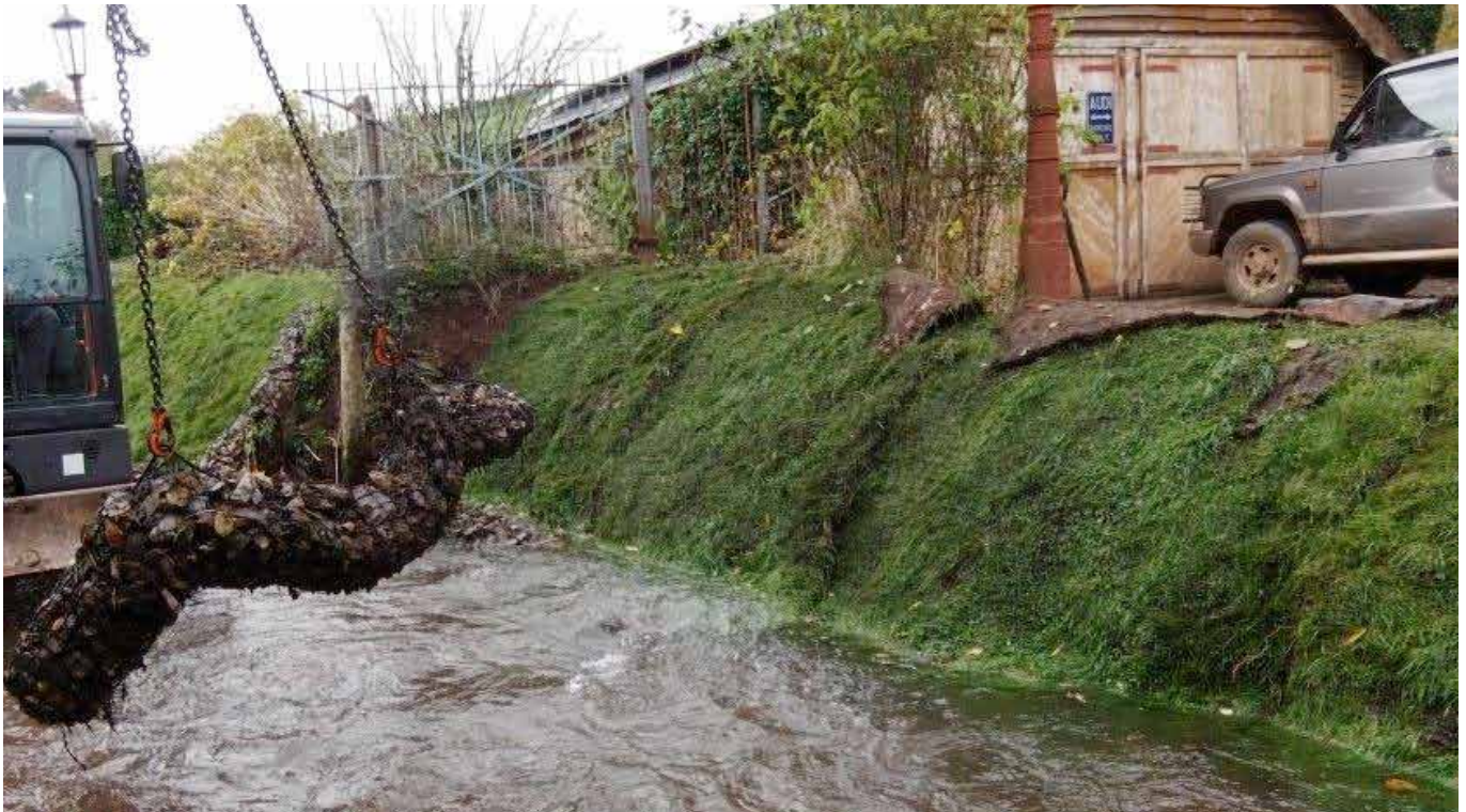
Photographs above show the Rock Rolls which are delivered to site prefilled and were quickly installed into the flowing water. The Rock rolls protect the toe against erosion and anchor the Shear Stress Turf.