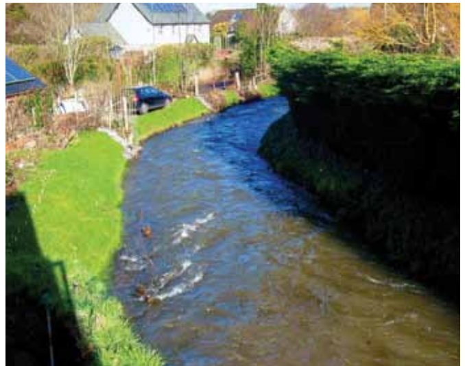
Photograph above taken 10th January 2014 show the new bank intact after a major flood event in only one month after installing the system.

The riparian owner commented that previously in an event of this type the road would have flooded. Kevin Coombes, Flood and Coastal Risk Officer for The Environment Agency commented: "An urgent solution was required and Salix were able to evaluate the situation and resolve the problem within the tight budget."