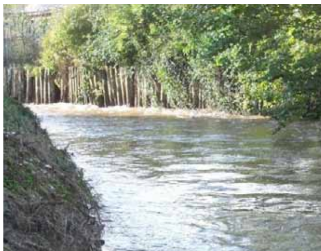
Photographs above show the original pole piled erosion protection in low flow and moderate flood on 28th October 2013.

The new bank protection provided a robust toe and a reinforced turf slope. This combination has the required shear stress resistance to the flow during peak flood events. Rock Rolls are 300mm diameter high strength nets ready filled with stone and were used instead of rip-rap or gabions. They were placed to provide "engineering" resistance to flow and also to create natural features with habitat value. They are sewn together where they touch to create one mass, either in line or where stacked up the slope. The pebble bedload was thought to be mobile so site won brushwood was placed around them to slow the water and reduce potential impact. As the slope was so steep and this was a live repair Salix installed "Shear Stress Turf". This is a turf reinforcement mat (TRM) grown off-site and therefore has immediate resistance to 6m/s flow. This reinforced turf instantly provided the required performance in this confined site.