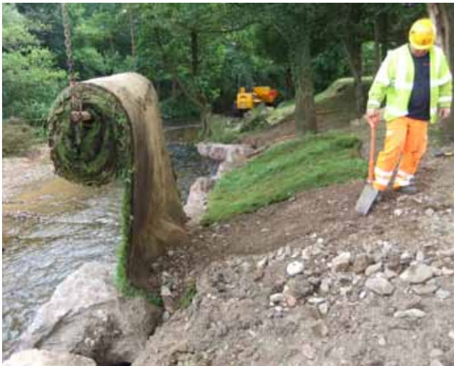
VMax 3 Shear Stress Turf provides long term erosion protection and vegetation establishment assistance while permanently reinforcing vegetation. At installation the turf can resist 6m/s flood events.