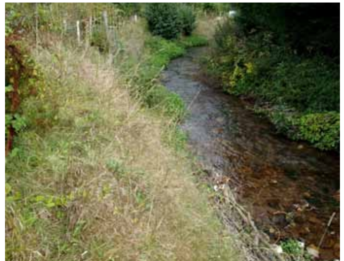
After only 10 months, in September 2014, new in-stream and waterline plants are colonising the new work and the slopes.