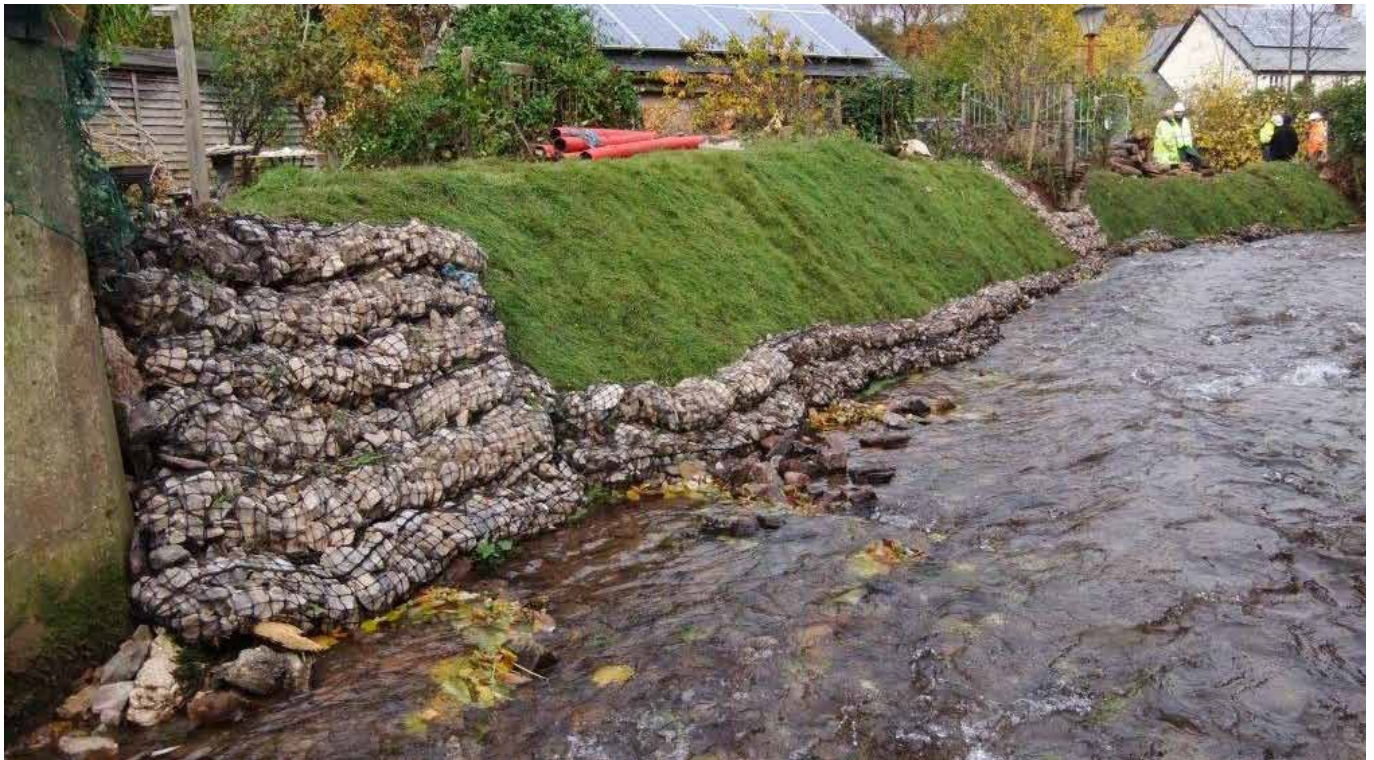
The new system installed after 2 weeks work, in November 2013, gives the river more room for flood events and a sustainable natural slope.