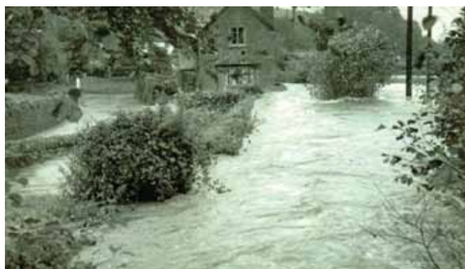
A flood event before the pole piled improvements were made to the river.

The old wood piling was removed and the bank behind was graded to about 45° as shallow an angle as achievable. The scrub and soft vegetation was removed, leaving the small bankside trees as they were integral to the bank stability.