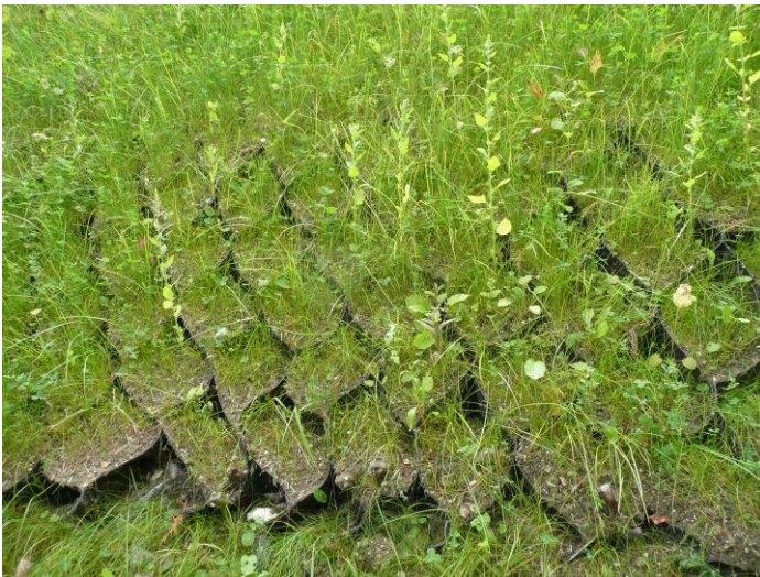
HydraCX in direct contact with soil