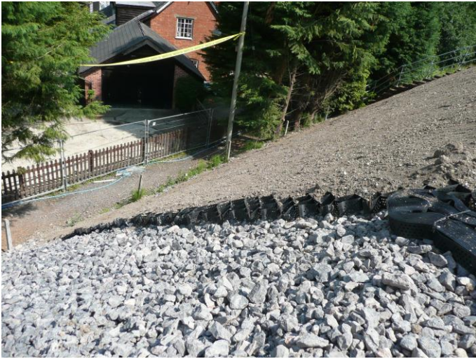
43 degree slope