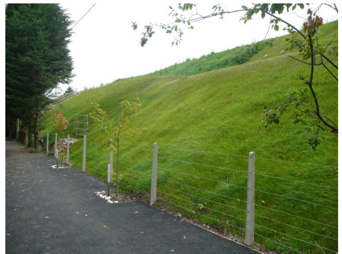
Fully vegetated within two months