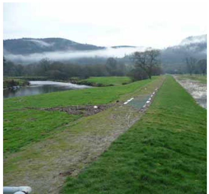
After the flood

“The pre grown NAG P550 performed very well during a significant flood event. There was no flood damage to repair on the banks protected by the NAG P550”.