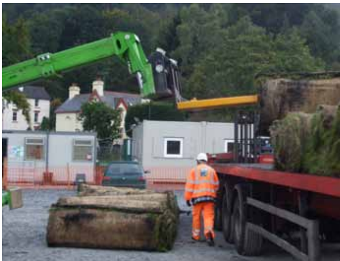
Salix Shear Stress Turf P550 delivered to site

Part of the scheme involved lowering and protecting flood embankments, creating a spillway, to provide an alternative route for flood flows thus reducing water levels in Llanrwst.